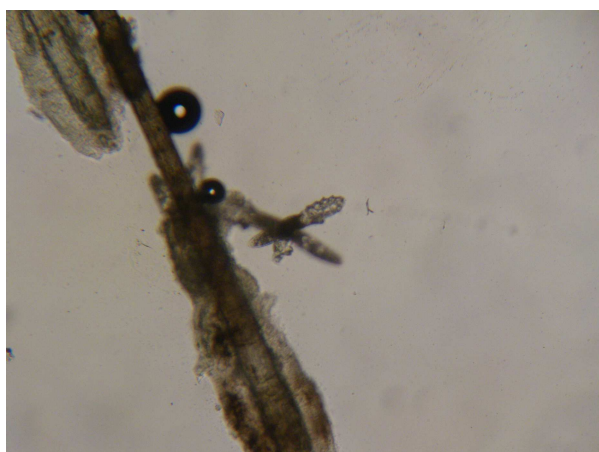
Figure 1: Demodex spp. onto eyelash (lenses 10 × 10, magnification x100).

The study comprised all eyelash specimens collected at the ophthalmological community wards and examined for Demodex spp. (Figures 1 and 2) at the Clinical Microbiology Laboratory of the Hellenic General Air Force Hospital in Athens, from June 1st 2016 to December 31st 2016.