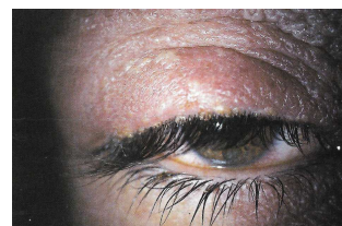
Figure 3: Palpebra skin lesions due to Demodex spp.

All patients had symptoms of blepharitis, no response to treatment with antimicrobial collyria, negative ocular microbiological cultures and negative Chlamydia examinations. Palpebra skin lesions included mild edema, itch, mild or no erythema combined with intense smegma secretion from eyelash follicles (Figure 3).