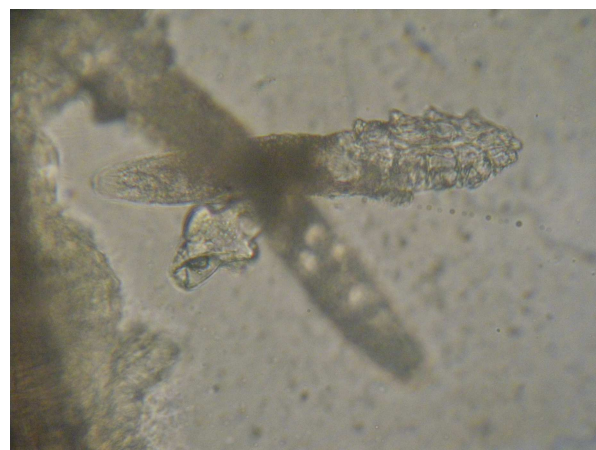
Figure 2: Demodex spp. onto eyelash (lenses 10 × 40, magnification x400).

All patients had symptoms of blepharitis, no response to treatment with antimicrobial collyria, negative ocular microbiological cultures and negative Chlamydia examinations. Palpebra skin lesions included mild edema, itch, mild or no erythema combined with intense smegma secretion from eyelash follicles (Figure 3).