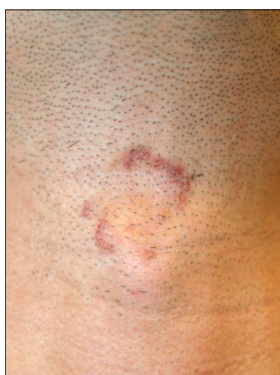
Fig. 1. Crusted erythematous papules (2~5 mm in size) arranged in an annular pattern.

(Fig. 2C). Verhoeff-van Gieson staining showed a markedly increased number of altered elastic fibers forming dense clumps in the upper dermis (Fig. 2D). Gomori methenamine silver stain and D-PAS stain were both negative for fungal elements. A diagnosis of EPS was made based on these clinical and histopathological findings. Despite treatment with topical 0.05% tretinoin nightly for 6 months, no improvement was observed.