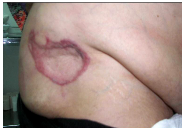
Fig. 3. Two months later, the defect appeared completely healed, with a small depressed scar.

No tool or test exists for making a confirmative diagnosis of Nicolau syndrome; it is based purely on the clinical features and their correlation with previous case reports. One report suggests that laboratory tests reveal creatine kinase and myoglobin as well as other markers of muscle damage 3 , but that author thought that a mere increase in creatine kinase and myoglobin does not automatically mean necrosis with muscle involvement. In addition, our