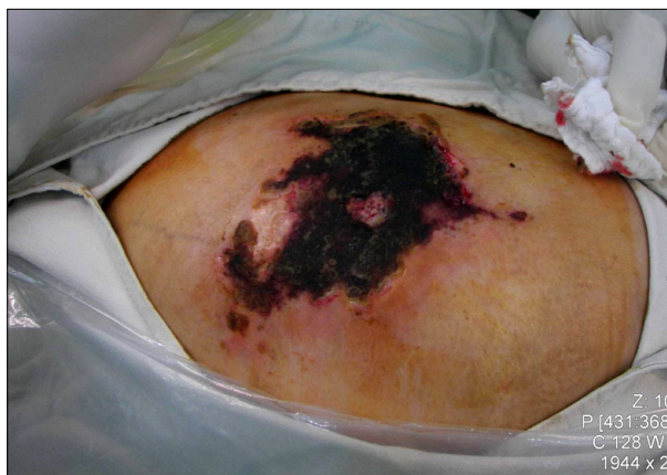
Fig. 1. Photography of right gluteal lesion three weeks post injection illustrating the nature and extent of the eschar.