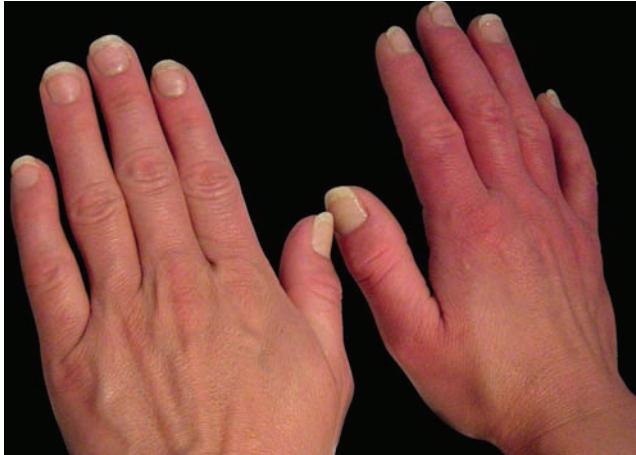
FIGURE 2: Erythema and edema on both hands, more pronounced on the right

any infection followed by fissures, blisters, painful ulcers, cyanosis, gangrene or necrosis. Many patients know that burning pain is relieved with cold water or ice, an electric fan or staying in places with low temperature. Some of these methods lead to skin maceration followed by epidermis slough thus increasing the damage to the skin barrier. Cold could trigger long lasting vasoconstriction provoking ischemia and tissue necrosis, what could be interpreted by patients as aggravation of the disorder. Cutaneous dystrophies could increase pain and at the same time slow skin repair, deteriorating their quality of life and leading to social isolation, and in case of hypothermia adding a life-threatening risk. The patient must be advised to discontinue these practices. Some patients could develop skin automutilation behavior; although its mechanism is unknown, the poor quality of life could be related to this condition. 2,18,32,34,36,62,66