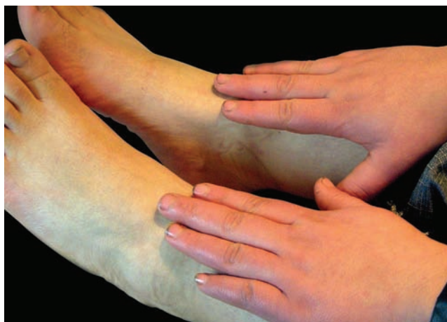
FIGURE 4: Acrocyanosis on both hands with slight livedo reticularis in the dorsal aspect. Feet are not compromised