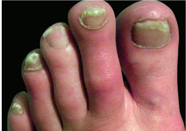
FIGURE 3: Combined erythema and edema due to foot erythromelalgia

Small fiber neuropathy is considered as an early disorder in painful diabetic neuropathy that contributes to the presence of distal ulcers. Moreover, it might be an interaction between the latter neuropathy and the microcirculation in these patients. The diabetic microangiopathy and neuropathy could add up to the EM with an overlapping of signs and symptoms generating difficulties in the