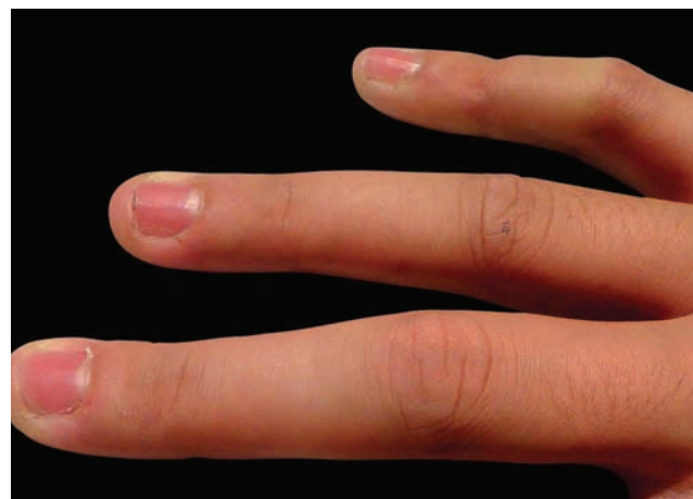
FIGURE 5: Red nails on hand