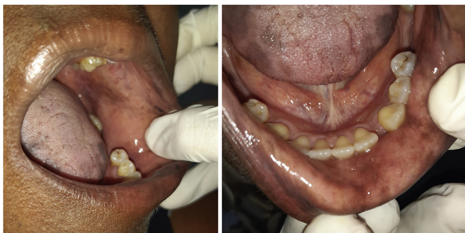
Figure 5 Attenuation of pigmented spots on the oral mucosa, when the medication was interrupted.

The diagnosis of HFS is based on its clinical characteristics and, in this case report, the patient was diagnosed with all degrees at different moments. When in the most debilitating stage, it was necessary to pause the medication, conduct recommended by Farr and Safwat 26 , who reported that the most effective management of HFS consists of increasing