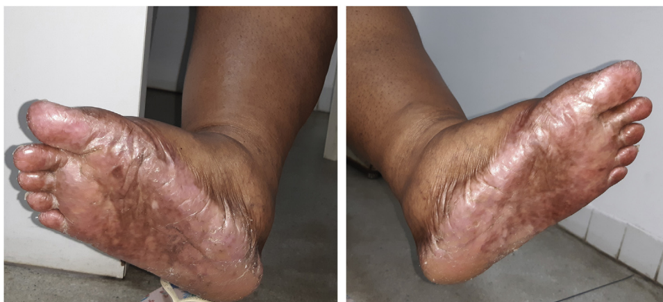
Figure 1 Hyperpigmentation, desquamation and dryness on the soles and inner region of the feet.

3.184.856, carried out at the Oncology Center of Hospital Universitário Oswaldo Cruz, Universidade de Pernambuco – CEON/HUOC/UPE, located in the city of Recife, state of Pernambuco Brazil.