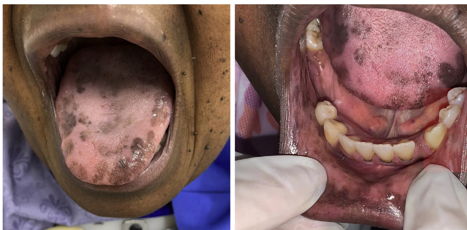
Figure 2 Clinical aspect of hyperpigmented spots on the oral and perioral region, located on the tongue, lip and bottom of the oral vestibule.