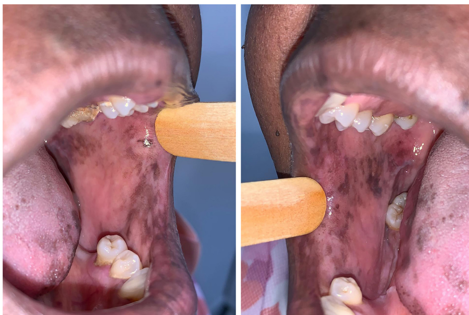
Figure 3 Clinical aspect of hyperpigmented spots on the bilateral buccal mucosa and tongue edges.

professionals, as well as the differential diagnosis with infectious processes and specific manifestations of the neoplasm.