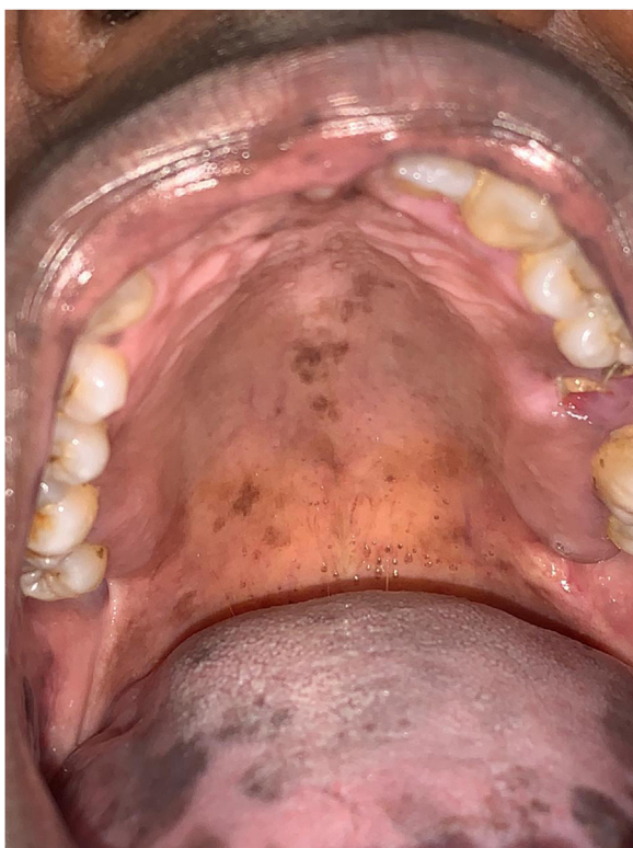
Figure 4 Hyperpigmented spots on the hard palate.

HFS was classified as a very common adverse reaction and, among all patients who developed the reaction, 17.0% had grade 3, as reported herein 23 .