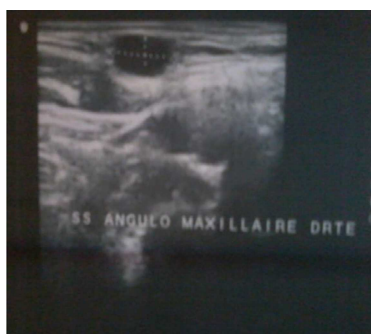
Figure 2: Cervical ultrasound demonstrates a mass in the neck (right level IB).

Overall, about 25% of patients will develop distant metastatic