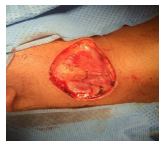
Figure 5: Showing preoperative view of the excisional site of the specimen.

disease after successful treatment of their primary tumor; the incidence increases till 40% to 50% of tumors that are >5 cm in size, deep to the fascia, and intermediate or high grade [10,11].