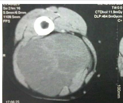
Figure 1a: CT: In homogenous masses of low density on CT in the posterior loge of the right thigh.

To the best of our knowledge, This is the first case describing an isolated subcutaneous metastases to the neck of a primary myxoid liposarcoma of thigh occurring 2 years after the treatment of the initial tumor.